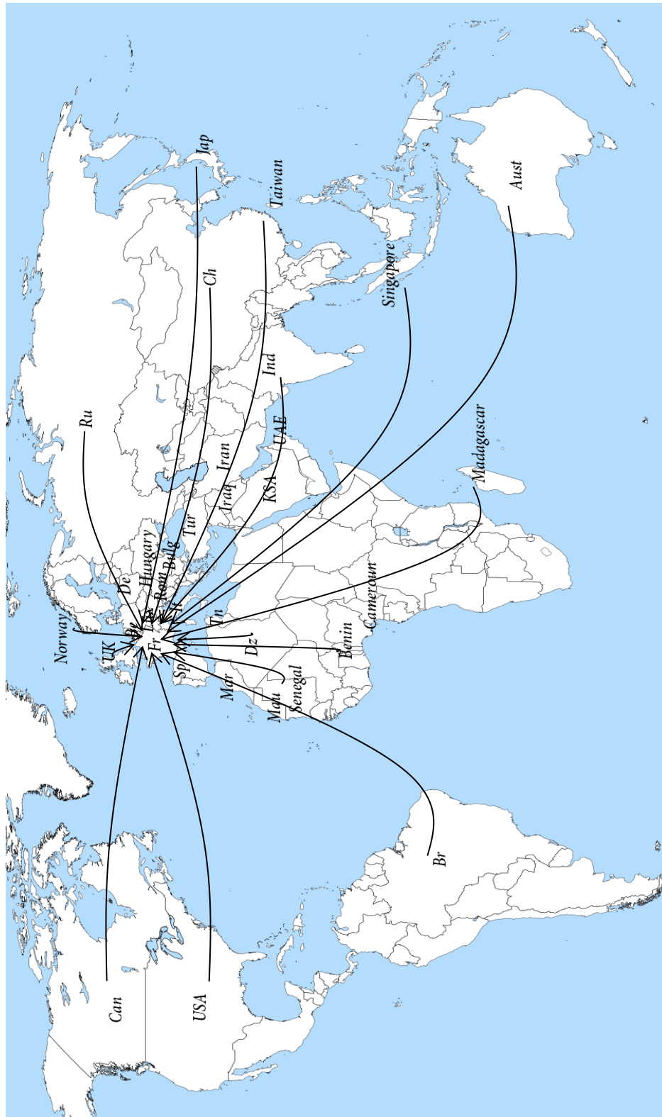
ICOME'21 INTERNATIONAL CONTRIBUTORS